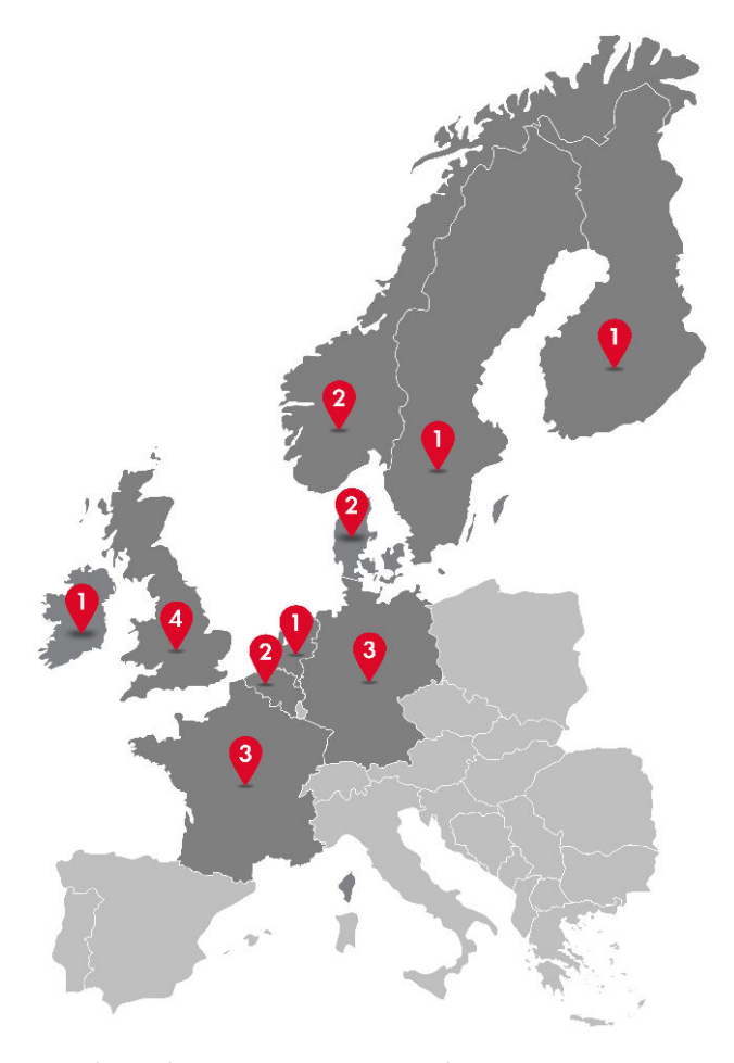
Q-Park's market position across ten Northwest European countries, in four of which we are the indisputable market leader.

We demonstrate that effective regulated and paid parking make an economic contribution to cities and society, and that a positive parking experience